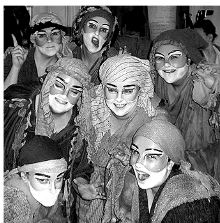
Ladies Chorus getting into character before the top of Act 1.