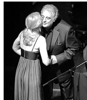
After introducing Plácido Domingo, Gala emcee, Academy Award nominee and New Orleans native Patricia Clarkson receives a kiss.

On March 20 and 22, 2009, the New Orleans Opera Association celebrated its return to grand opera on the Plácido Domingo Stage with Bizet's Carmen . The sold-out performances to standing ovations demonstrate that opera, which made its North American debut in New Orleans in 1797, is here to stay in New Orleans.