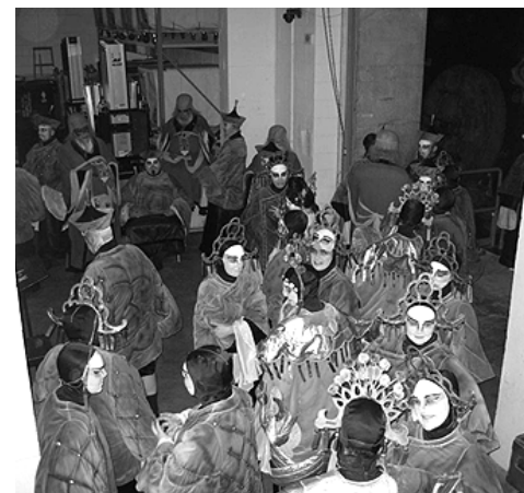
Turandot Chorus back stage getting ready to sing.