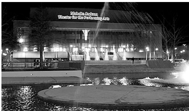
Outside the Mahalia Jackson Theater for the Performing Arts.