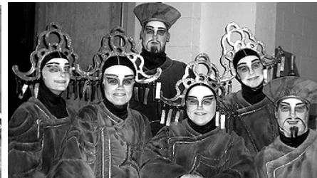
Choristers ready for Act 2