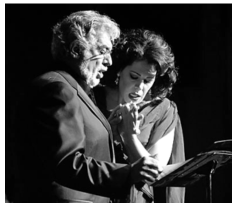
Tenor Plácido Domingo and soprano Sondra Radvanovsky perform during the Gala.